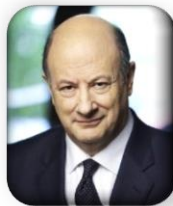
Jan Vincent Rostowski

Adviser to the Managing Director and CFO, World Bank Group